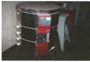
92- DELTA 18 DRUM SANDEF