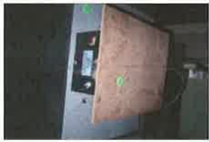
86- EZE-KUT FOAM CUTTER