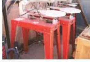
8-HAWK PRECISION SCROLL