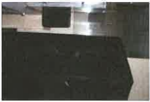
100-LARGE MEDAL CABINET