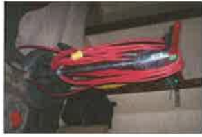
117-CLARK FLOOR MACHINE