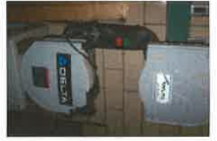
5- DELTA BAND SAW