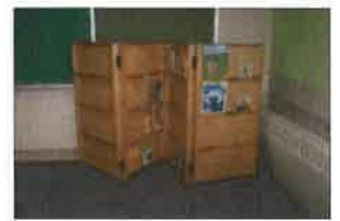
9-FOLDING MAGAZINE RAC