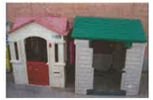
1-LITTLE TIKES PLAY HOU