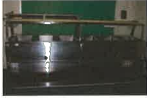
16-EAGLE HOT FOOD TABLE