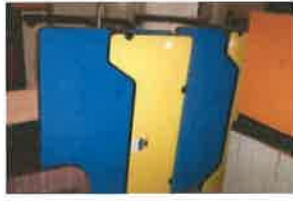
SET OF (2) COMPUTER DES