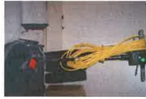
118-BRADY FLOOR MACHINE