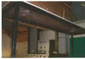
72-2FT X 8FT TABLE