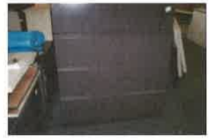
-(4) DRAWER FILING CABINI