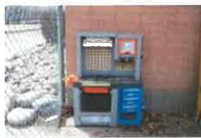
66-PLASTIC TOOL STATION