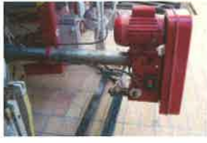
12-DAYTON DRILL PRESS