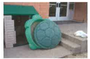
65-TURTLE SAND BOX