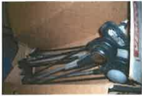
PRECISION DRAFTING MACHINE