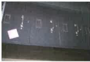
97- (5) DRAWER FILING CABINI