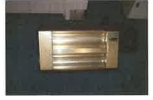
ORIA SUN-MITE INFRARED