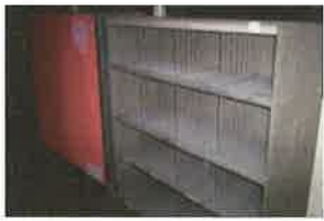
96-LARGE ROLLING SHELVES