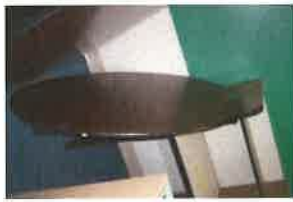
1 ROUND TABLE WITH FOL