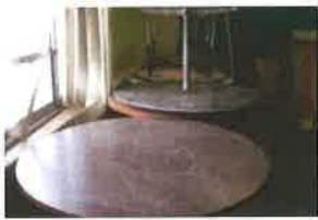
36-LARGE ROUND TABLES