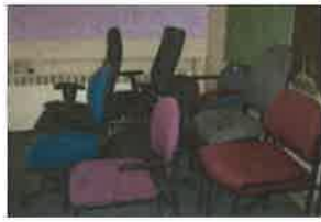
83- LOT OF (8) OFFICE CHAIR