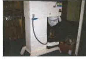
3-LAKESLEE DD-60 COMMEF