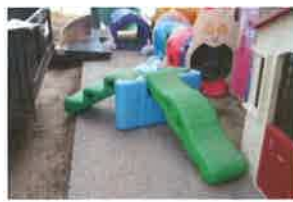
-PLASTIC SLIDE AND SEESA