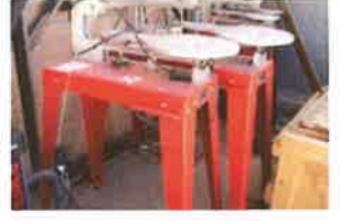
10-VK PRECISION SCROLL SAW