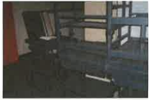
6-METAL COMPUTER TABLE