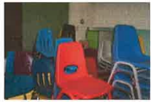
87- LOT OF (12) LARGE PLASTIC C