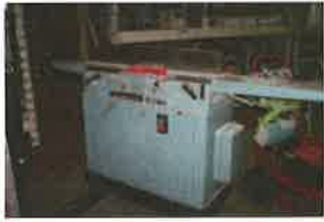
2-DELTA DJ20 WOOD PLANE