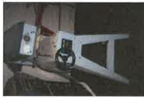
93-HAWK PRECISION SCROLL