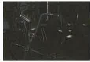
3-SCHWINN EXERCISE BIKI