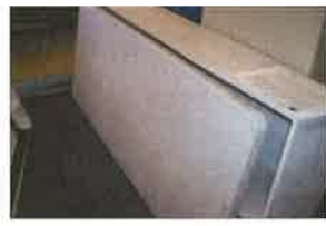
9-5X2 WHITE PLASTIC TABL