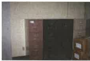
98- (4) DRAWER FILING CABINI