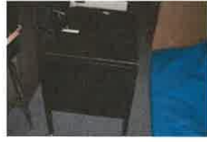
29-MALL ROLLING FILING CABI