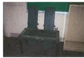
RENS PLASTIC TABLE AND I