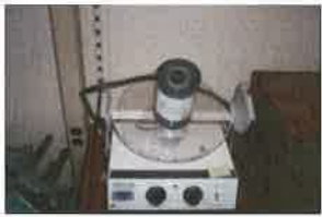
101- PLANETARIUM PROJ