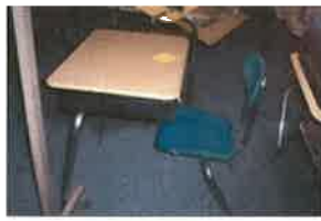
93- 100-SET DESKS WITH ATTACHE