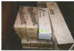
87- Lot of 72 Hertz Rapid Start Ball