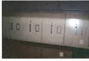
27-3(5) DRAWER FILING CABIN