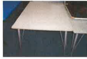
34-SET OF 3 4'X2 ' TABLES