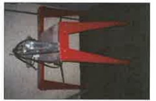
94-HAWK PRECISION SCROLL