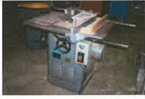
7-ROCKWELL 10 INCH UNISA