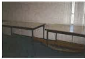
83- SET OF (2) 3'X6' TABLES