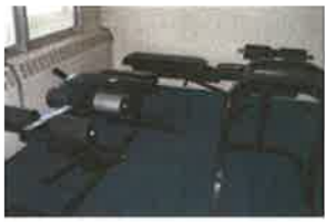
90- (3) PIECES OF WORKOUT EC