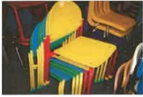
88- LOT OF (7) LARGE PLASTIC CH