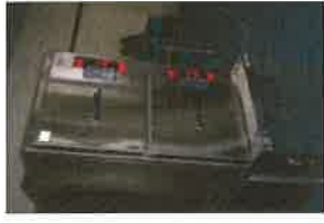
21-VULCAN FOOD STEAMER