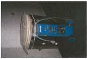
95-CRESS ELECTRIC KILN