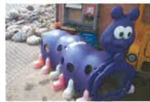
-SET OF PLASTIC CRAWLEF