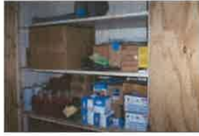
77- MISC BUS PARTS