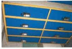
32-SET OF METAL LOCKERS