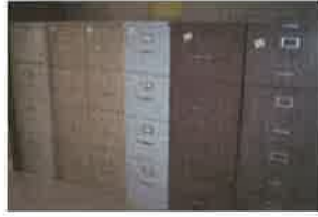
84- 4 DRAWER FILING CABINET