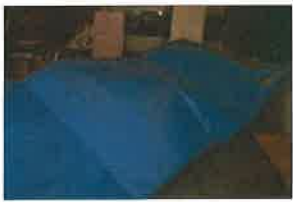
85-MF AMERICAN WRESTLING