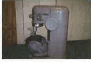
22-HOBART COMMERCIAL MIX