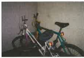
-MURRAY-EAGLE RIVER BI