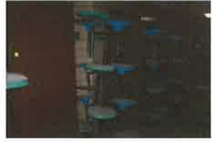
81- 18FT CAFETERIA TABLES V