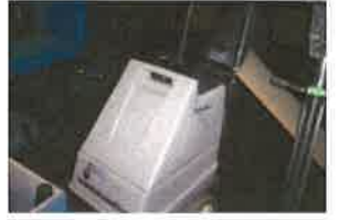
114-AQUANET CLASSIC FLOOR MACHINE