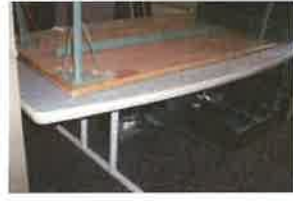
3-8'X4' CONFERENCE TABLI