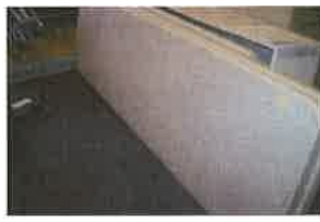
7-WHITE PLASTIC TABLE 8X