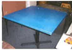
OF (2) SQUARE BLUE TABLI