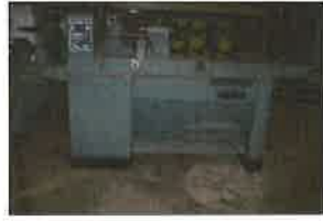
4-DELTA WOOD LATHE