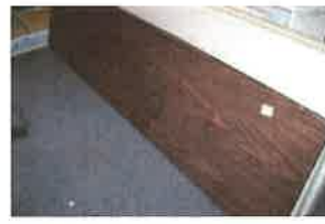
X2' TABLE WITH FOLDING L