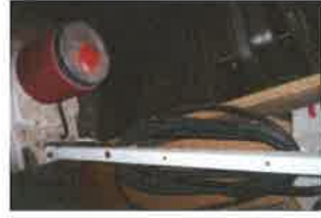
113-ADVANCE FLOOR SCRUBBER