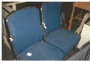
103- SET OF (4) STADIUM CHAI