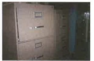
99- (2) DRAWER FILING CABINI