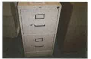
89- 2 DRAWER FILE CABINET