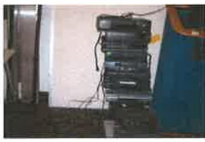
46-LOT OF (14) VCRS