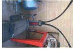
13-BOWFLEX POWER PRO