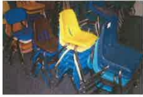
89- LOT OF (10) SMALL PLASTIC CH