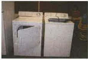
91-WASHER AND DRYER