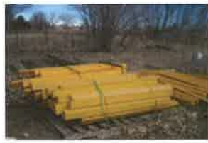
58-PARKING LOT BUMPER