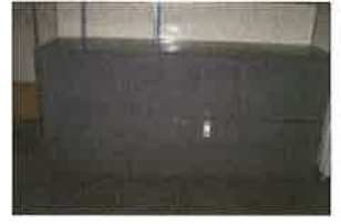
30-LARGE METAL CABINET