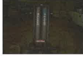
19-WALKER HIGH LIFT JACK