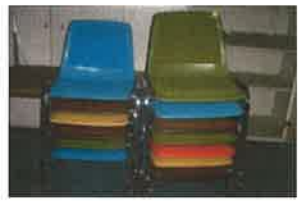
85- SET OF 14 ASST. COLORS-PLASTI