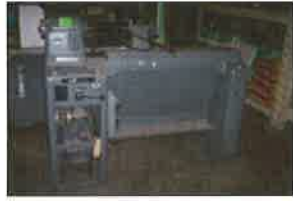
3-DELTA WOOD LATHE