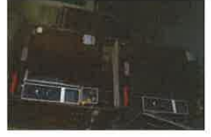
20-ARKET FORGE FOOD STEA