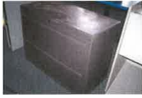
26-3(2) DRAWER FILE CABINET