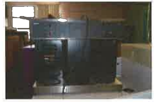
40-BUNN COFFEE MAKER