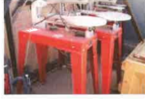
9-WK PRECISION SCROLL SA