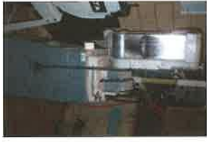
6-KWELL BAND ROTARY SAW