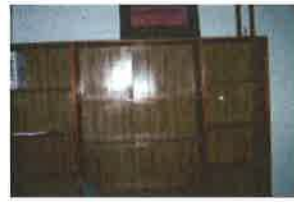
LARGE WOODEN BOOK SHE