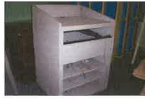
33-3-LARGE COMPUTER STANI