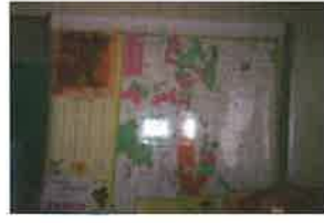
28-NEW MEXICO ROLL-UP MA