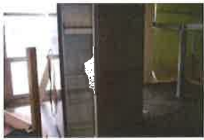
86-ERVATOR 2FT X 1FT REFRIG