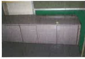
31-LARGE METAL 5 DRAWER CAB