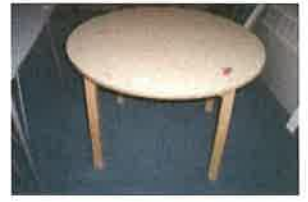
35-SMALL ROUND TABLE