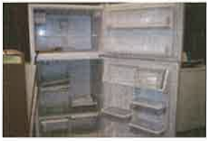
90- 2 DOOR COLDSPOT REFRIGI