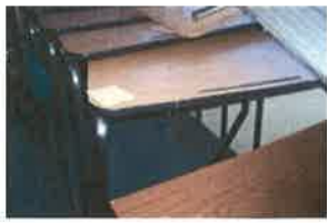
92- SETS OF 10 LARGE STUDENT