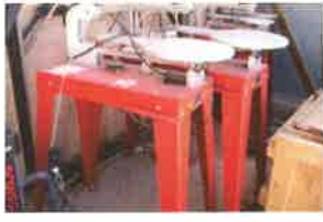
11-VK PRECISION SCROLL SAW