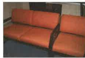
8- SET OF (2) LOBBY CHAIR