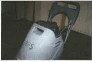
115-ADVANCE AQUACLEAN X