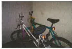
SP ALL TERRAN CRUISER 1