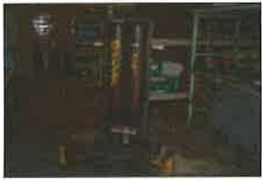
1-FLEET HIGH LIFT JACK