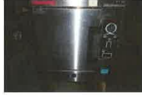
18-ARKET FORGE FOOD STEA