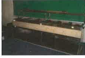
17-EAGLE HOT FOOD TABLE