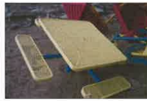
59-TABLE WITH BENCHES